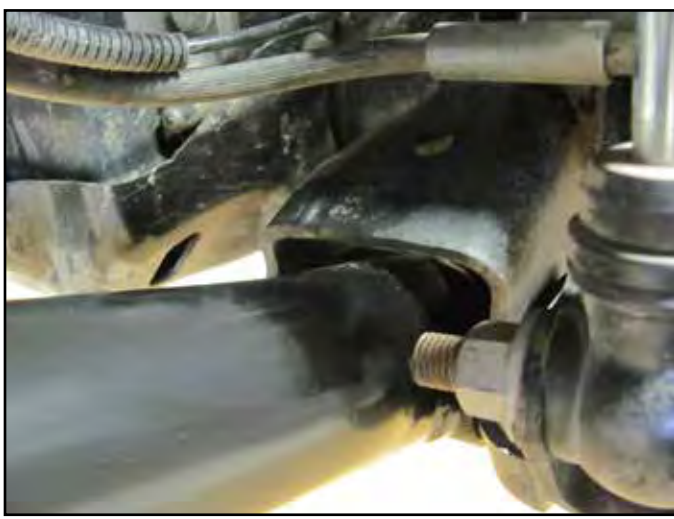
Proceed to step 2. Complete installation on one side before starting other side.