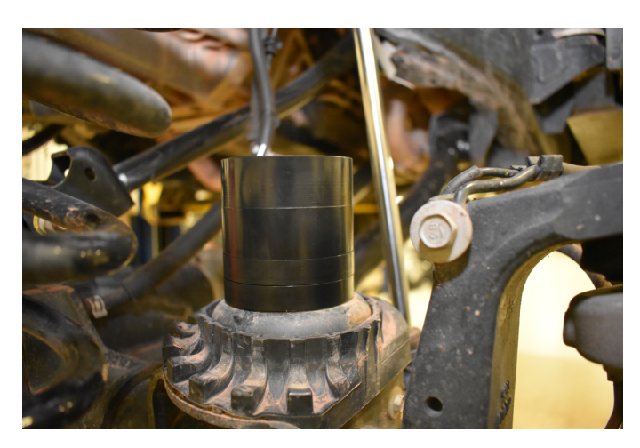
3" Bump Stop Configuration Pictured